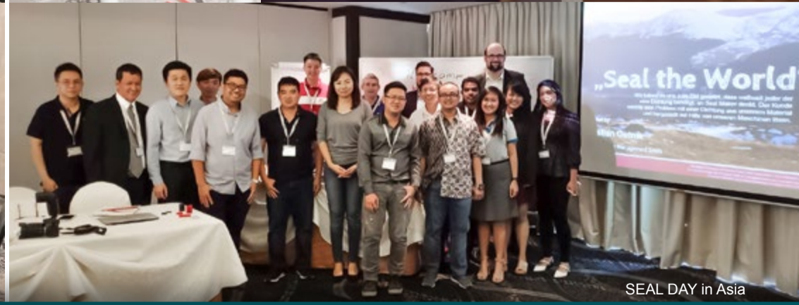
SEAL DAY in Asia