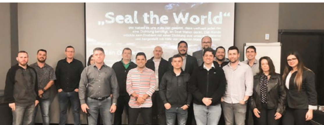
SEAL DAY in Latin America

Singapore followed in early November as another location for a SEAL DAY in Asia. In addition to providing basic knowledge in the field of sealing technology a supplementary workshop day was held afterwards. Thus, there was enough time to discuss practical examples and so-called “hard nuts”, and to develop solutions. Seal Maker would like to thank all participants for their interest and for the inspiring discussions. We are already planning the next SEAL DAY - further information will be provided on time.