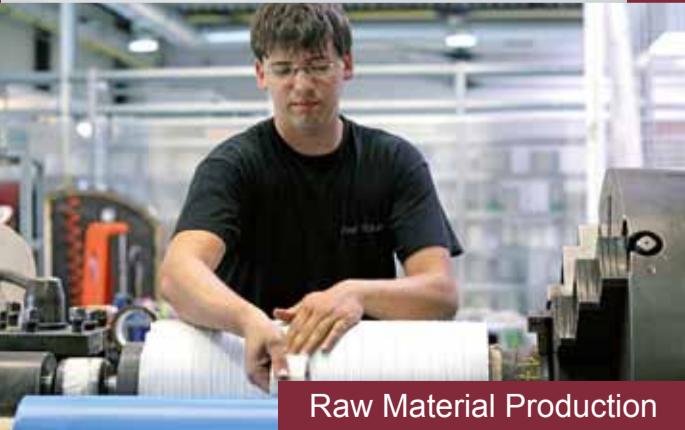
Raw Material Production