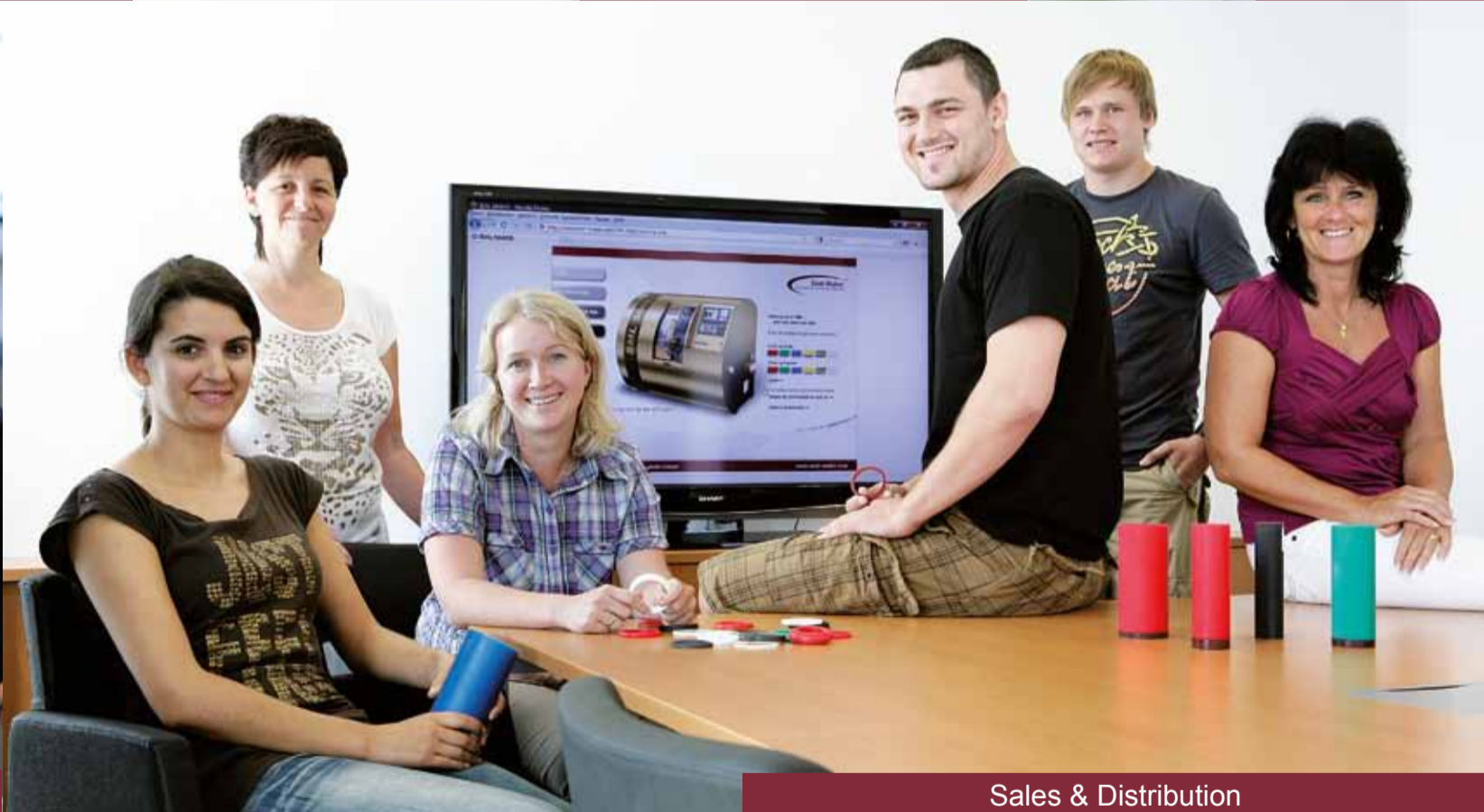
Sales &amp; Distribution